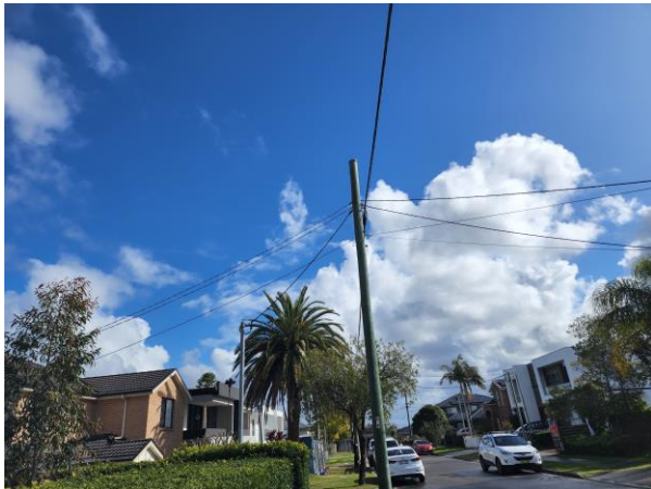
Existing electrical supply