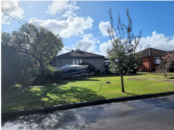
Subject site, looking North