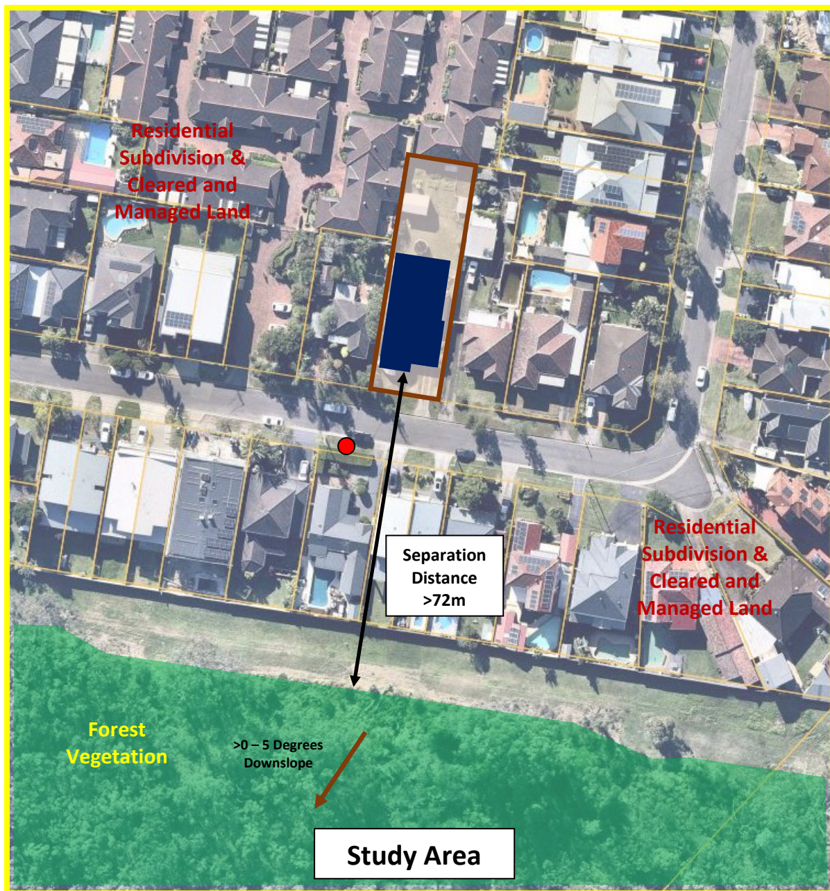
Map 1 – Study Area / Subject Lot / Slopes / APZ extent