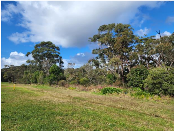
Forest vegetation, looking South East