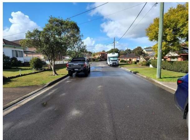
Parkview Avenue, looking East