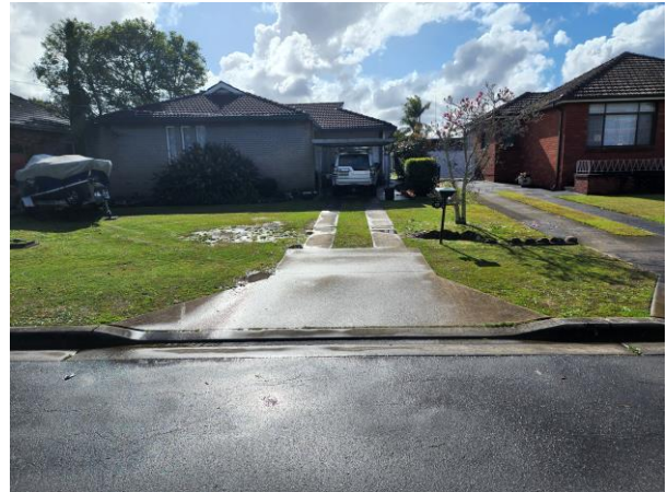
Existing driveway, looking North