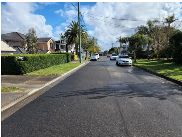
Parkview Avenue, looking West