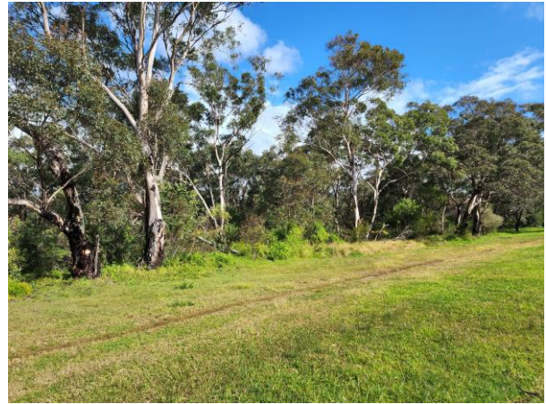
Forest vegetation, looking South West