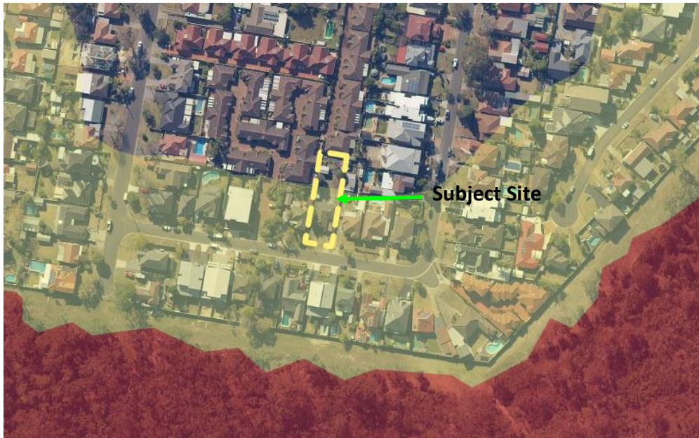
Extract Canterbury – Bankstown Council LGA Bushfire Prone Land Map